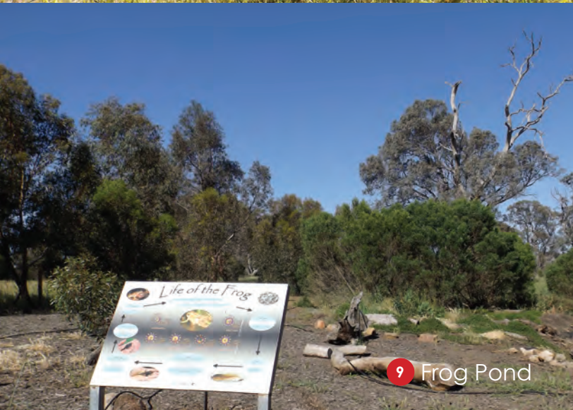
9 Frog Pond