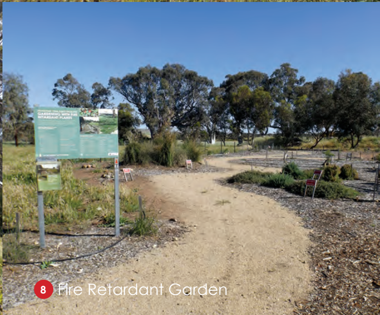
8 Fire Retardant Garden