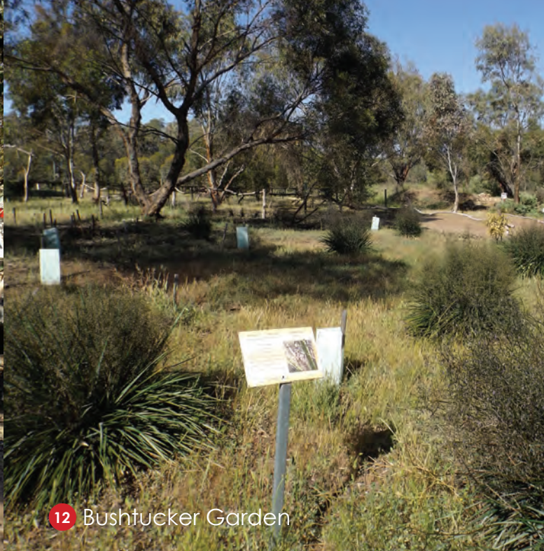
12 Bushtucker Garden