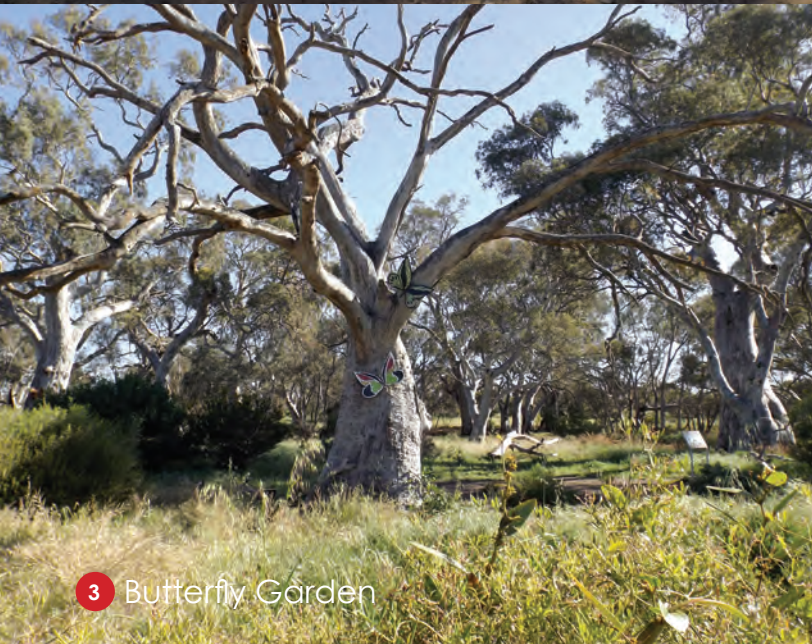
3 Butterfly Garden