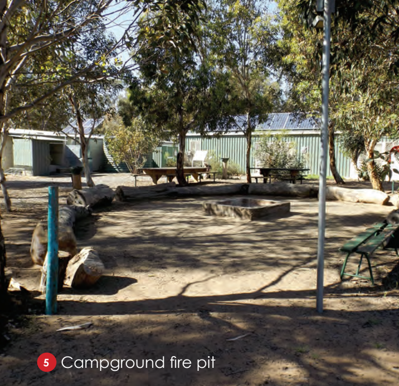
5 Campground fire pit